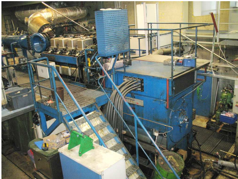
The 1.6 MVA diesel unit in the laboratory.